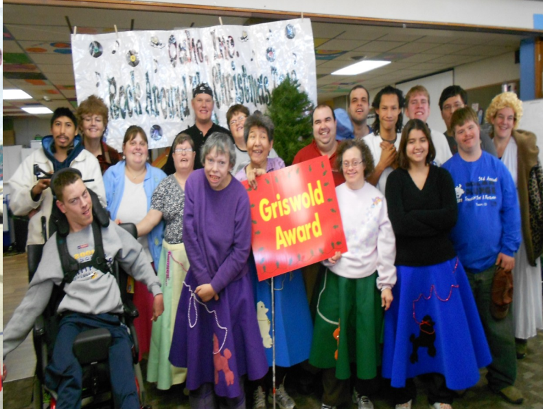
OAHE, Inc. takes home another GRISWOLD Award for their Parade of Lights float . This year's theme: OAHE, Inc. Rocks Around The Christmas Tree